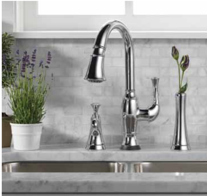
Talo combines nature's beauty with state-of-the-art functionality such as SmartTouch and MagneDock technologies for ultimate convenience.

Talo faucets feature Brizo-exclusive SmartTouch® technology—currently available on the Pascal® Culinary Faucet and debuting later this year on the sleek and geometric Venuto® pull-down kitchen faucet—which gives your clients the ability to turn the faucet on or off by simply tapping anywhere on the handle or spout. That means regardless of full hands or messy fingers, your clients can easily turn off the water flow between tasks.