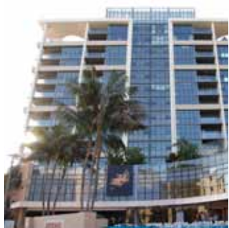
The Astoria Luxury Residential Towers in Irvine's Central Park West features several Brizo designs.

Orange County, California, is well-known for its beautiful beaches, Disneyland® theme park and exclusive neighborhoods. And although it's far from the Tuscany region in Italy, the Tuscan/Mediterranean influence is evident in everything from shopping centers to mansions. So when the Orange County Chapter of ASID (American Society of Interior Designers) organized a Design Tour focusing on contemporary living styles in a newly constructed high-rise complex, it took a risk—that in the end, paid off.